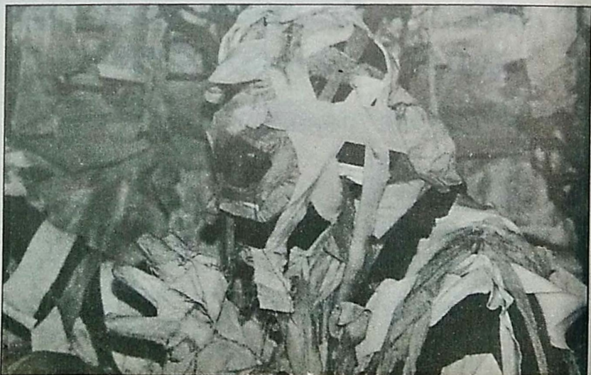
Rothaford Gray as the mummy.